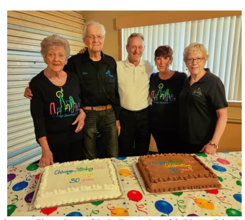
Chicago Jitterbug Club Board -- 30 Year Birthday

Summer Dance Party Dates Black and White Dance Album ABA Caribbean Cruise Deal Inside Drop off renewals at a dance party or put in the mail