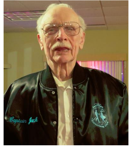
Chicago South Elks Lodge Hall