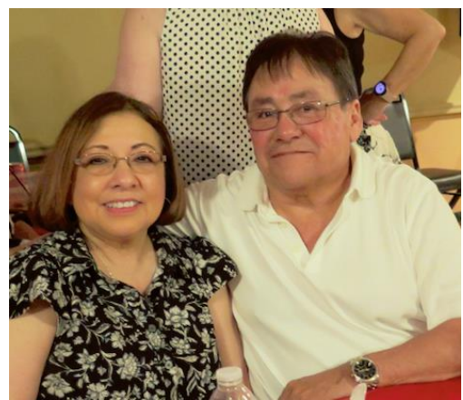
Black & White Night