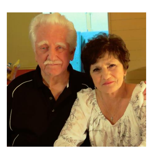
Chicago Jitterbug Club